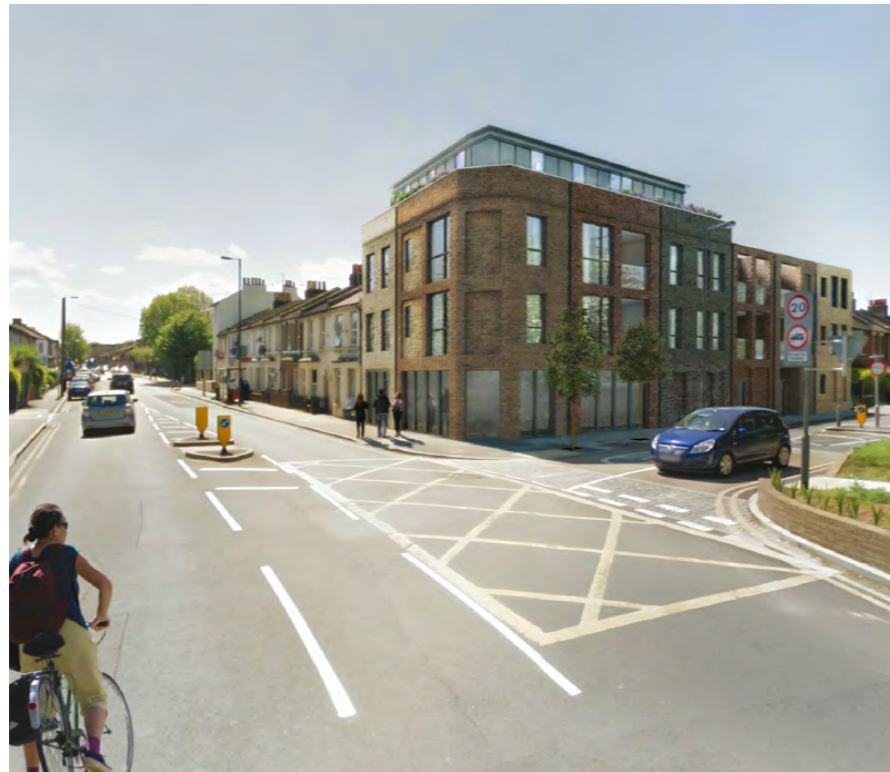
Photo Realistic View From Haydons Road

Composite Timber/ Aluminium Window RAL: 9002 - Pearl Light Grey Composite Timber External Doorset RAL: 9002 - Pearl Light Grey