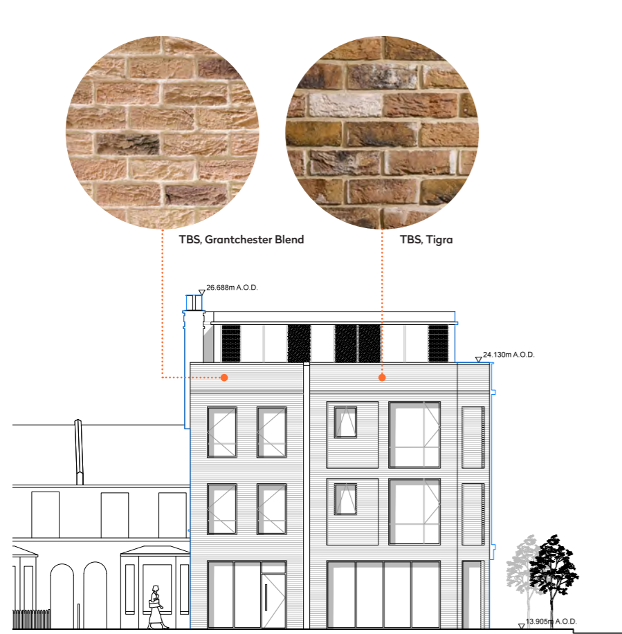
Proposed East Elevation (Haydons Road)