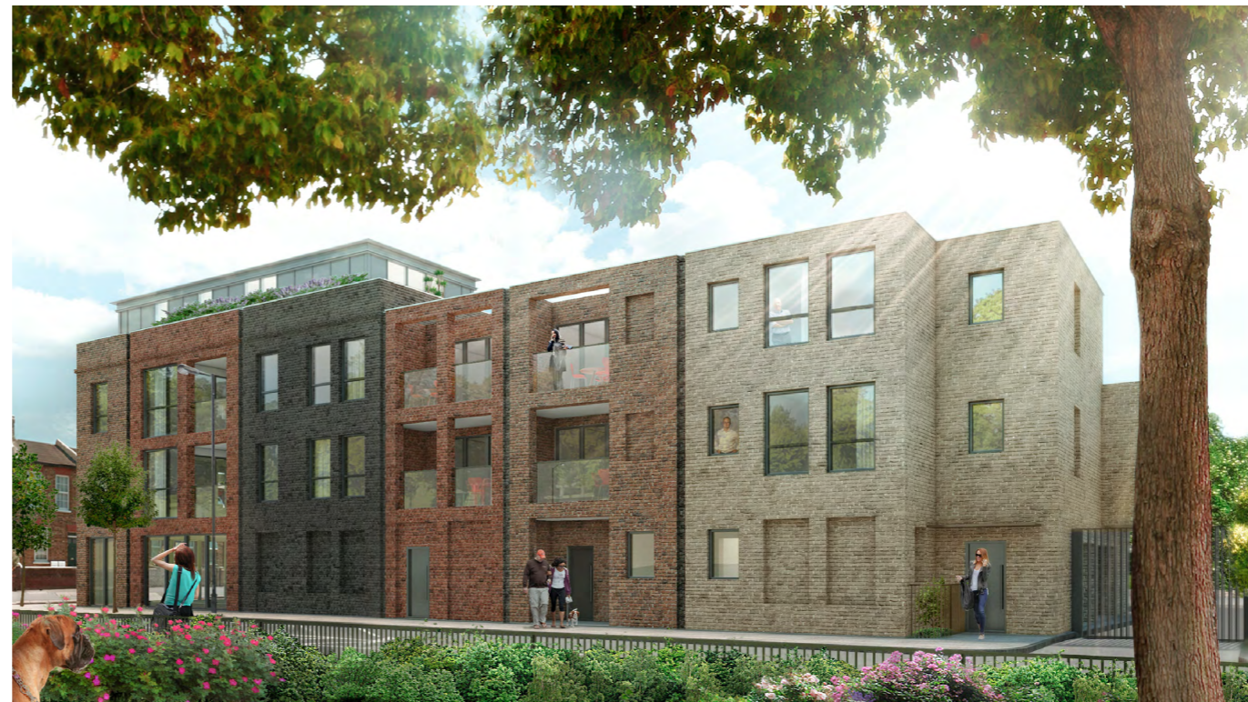
Photo Realistic View From Haydons Road Recreation Park